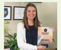
2020 "Top Company for Women to Work for in Transportation"