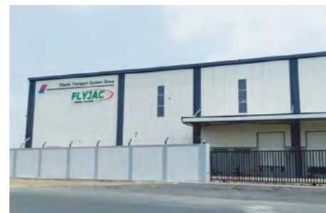
Oragadam logistics center

Flyjac Logistics Pvt. Ltd., which operates 3PL and freight forwarding services mainly in India, being one of the largest integrated Logistic Service providers in India has opened a new modern logistics center in Oragadam, near Chennai in June 2020. Oragadam is the nerve center of industrial activities in Chennai and home to many companies including six global automobile manufacturers. This new facility, conveniently located just one-hour away by car from the Port of Chennai, helps providing one-stop logistics services to customers as a base for handling import and export cargoes and JIT (Just In Time) delivery.