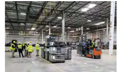
Huntsville in-plant logistics service

Carter Logistics, headquartered in Indiana, U.S., has developed its Auto Parts Logistics business using its unique Milkrun business model, and has been recognized by the customers as a top service provider for cross-docking of production parts and transportation of service parts. Carter Logistics has partnered with two large OEMs to provide the in-plant logistics services for a new automobile manufacturing facility located close to the city of Huntsville, Alabama. Carter was awarded the business in the summer of 2020 and started training and start up activities in the fall of 2020. At full capacity in the fall of 2022, Carter will employ close to 250 forklift operators on two shifts and will be responsible for handling over 15,000 daily skids (pallets) inbound and the unloading of more than 150 daily routes into the facility. Carter is excited to build upon its current service offerings to include in-plant logistics.