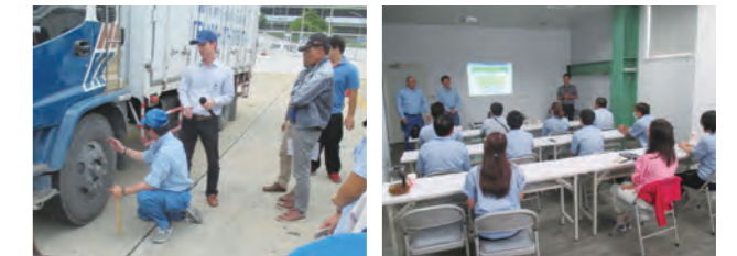
Training for drivers (Thailand) Training for warehouse staff (Taiwan)

In order to promote safety activities in the same way as in Japan and raise awareness of safety management, we send Safety Caravans led by Japanese instructors to overseas and engage in improvement activities together with local staff. We work to improve issues at relevant sites and provide ongoing support regarding safety.