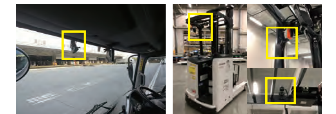
Dashboard cameras for trucks

In addition to all trucks it owns in Japan, the HTS Group has also installed dashboard cameras in forklifts (approximately 1,900 as of March 31, 2019) so as to be used for daily activities to secure safety including confirmation with finger pointing and calling during operation. We are also installing dashboard cameras in overseas group companies.