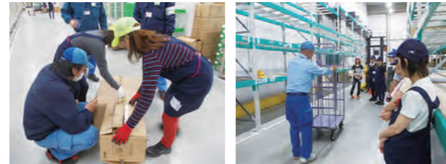
Safety practical training for cutter Experiential sessions for carts

At the HTS Group, we envision a full range of scenarios in workplaces and implement appropriate on-site training sessions based on these, covering both practical training and experiential sessions.