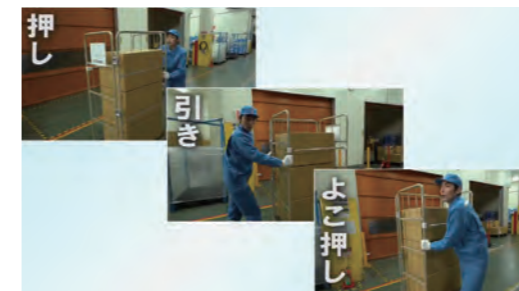
The screen showing how to use a cart 1. Push, 2. Pull, 3. Lateral push