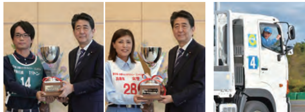
Prime Minister Abe awarded a trophy (Left) 11-ton category winner (Right) Female drivers category winner Skill competition

The HTS Group sent 14 contestants to this competition, where contestants strive for the highest score in both the academic knowledge and skill competitions (inspection and driving). They achieved magnificent results by winning higher rankings in all categories, including 3rd and 4th in the 4-ton category and 3rd in the Trailer category, in addition to two winners in the 11-ton and female drivers categories.