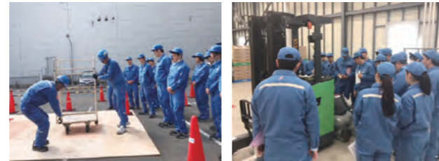
Hand cart training Forklift inspection training

The HTS Group conducts lectures and practical trainings for new employees to acquire safety knowledge when join the Company.