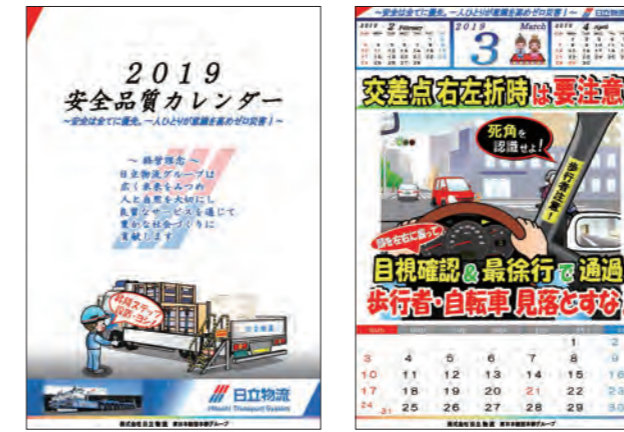
Safety education calendar

We post calendars with easy-to-understand illustrations in workplaces to educate and remind employees.