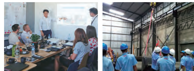
Preliminary meeting (Poland) Training sessions (Indonesia)

For safe transportation, installation and setting up of large instruments such as railway cars, power plants and industrial machinery, and precision equipment such as laboratory and medical equipment, it is crucial to make a careful plan and follow through the plan at the site. We closely examine the plan and give on-site instructions to ensure safe operation.