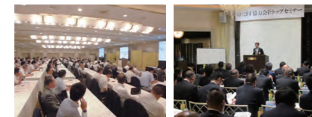
Top seminar in VANTEC Group

The HTS Group considers its transport partner companies are important partners. Each group company holds a top seminar semiannually by inviting management from partner companies for mutual information sharing.