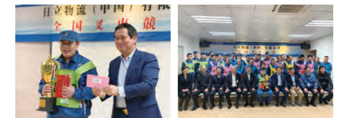
Hitachi Transport System (China), Ltd. forklift competition winner Hitachi Transport System (China), Ltd. forklift competition contestants

From FY2013, the HTS Group overseas locations have held forklift competition for local employees. Japanese supervisors are sent to these events to boost the globalization of HTS's culture of corporate safety in general as well as to impart safety technologies. These competitions also serve the purpose of helping individuals to be more aware of their own growth trajectory through healthy competition between local employees.