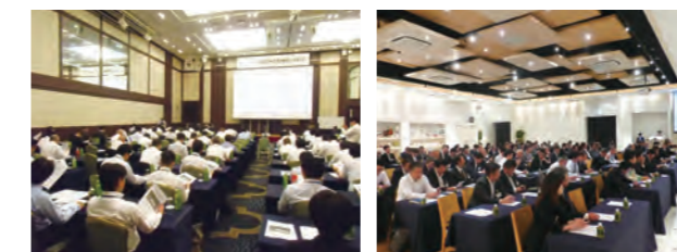
Top seminar in Chubu Area