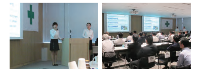
Presentation by VANTEC SUMISO LOGISTICS (WUHAN) CO., LTD.

We are working on further bolstering of on-site operations of the entire HTS Group by having each site make a presentation on their efforts for "improvement of on-site operations" to share and expand the best practice of operational safety of the Group. In FY2018, as a representative of overseas group companies, VANTEC SUMISO LOGISTICS (WUHAN) CO., LTD. made a presentation about their efforts for safety and quality to increase trusts from customers.