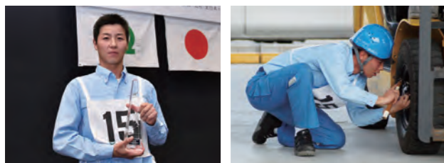
2nd prize winner Inspection competition

The HTS Group sent 13 contestants to this competition, where contestants strive for the total score of three categories of academic knowledge, inspection skills and driving technique, and won the 2nd prize.