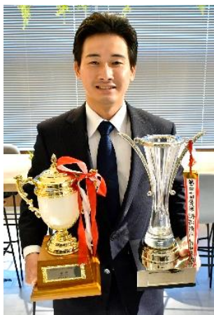
• General division

Our Group's forklift operators won in General Division (won the first prize for three consecutive years)