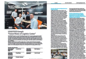
Employee Roundtable Discussion