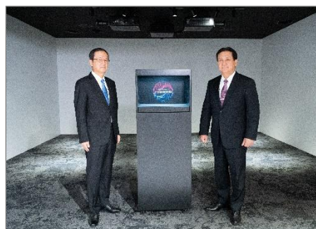
Commemorative photo taken with LOGISTEED Hologram