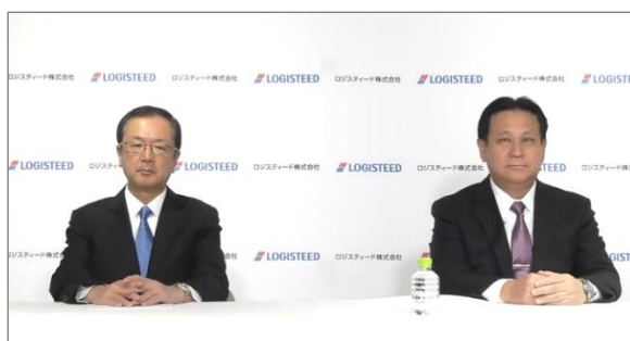
Message received from CEO and COO