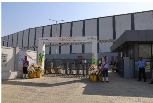
Exterior of new warehouse

*Multipurpose Logistics Center (MPLC): A logistics center which enables to provide various services as a hub center for 3PL operations, freight forwarding, and domestic transportation.